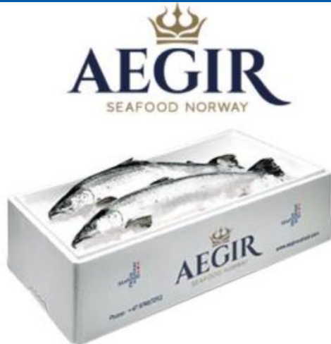
Figure 2: Aegir's product