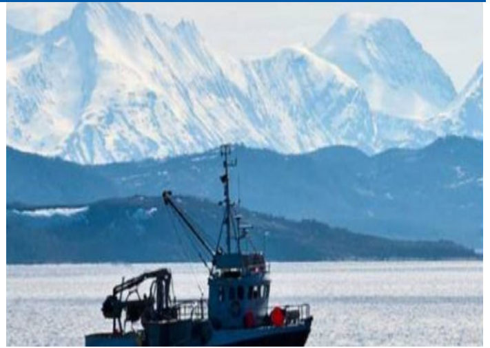
Figure 3: Aegir's operation in the Norwegian sea